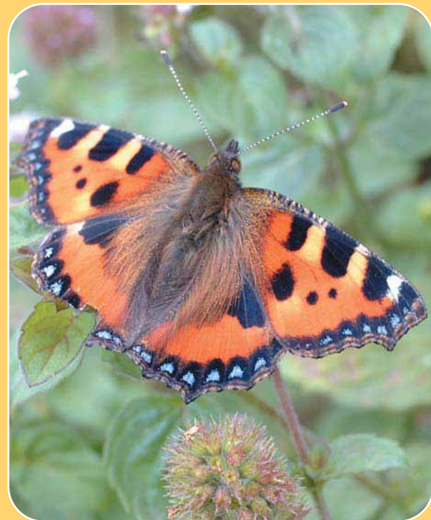
Butterfly picture