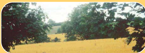
Views across Ellastone

Landranger Series Derby and Burton upon Trent Sheet 128 or Buxton etc Sheet 119 Explorer Series 259